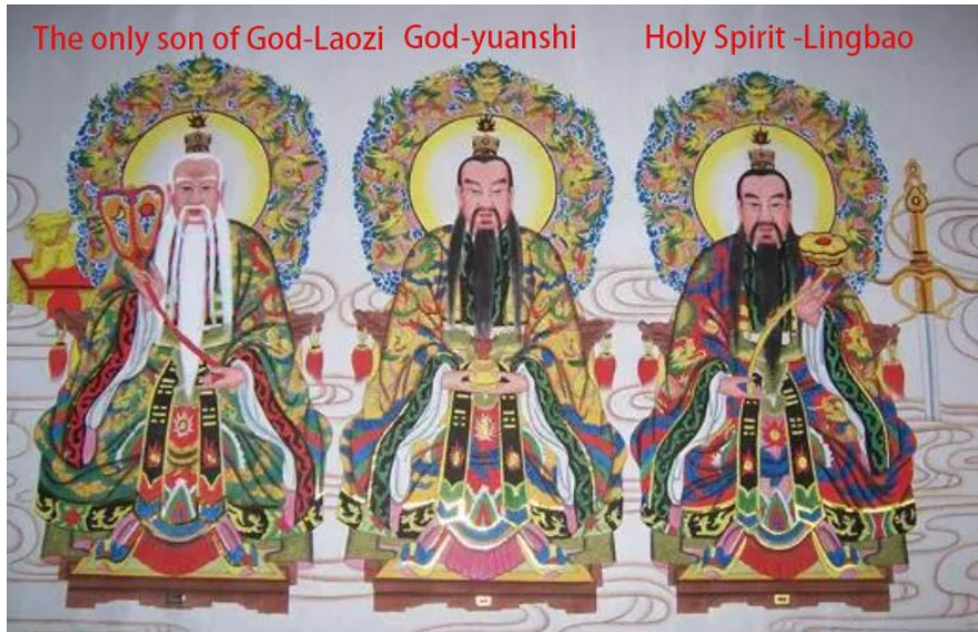
The only son of God-Laozi God-yuanshi Holy Spirit -Lingbao