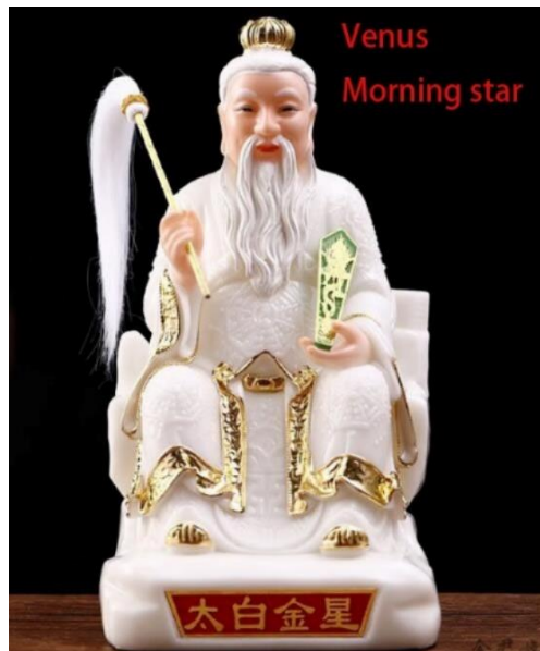
Venus Morning star

From the images, we can see that Laozi is Archangel Michael and morning star. Actually in Taoism Laozi is the son of God Yuanshi, the Holy Spirit (the One) and the Word (God).